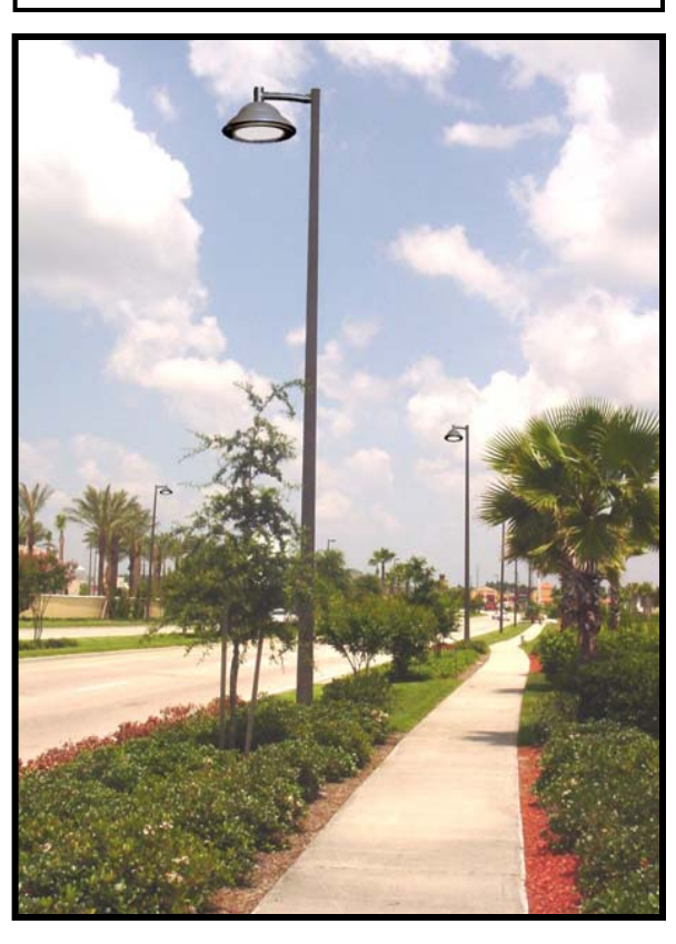
Mounting height maximum 30 feet for street fixtures

This will require signed / sealed letter certifying that lighting was installed consistent with Lighting Ordinance.